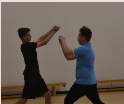
Captain Hook and Peter Pan preparing for their battles at sea!