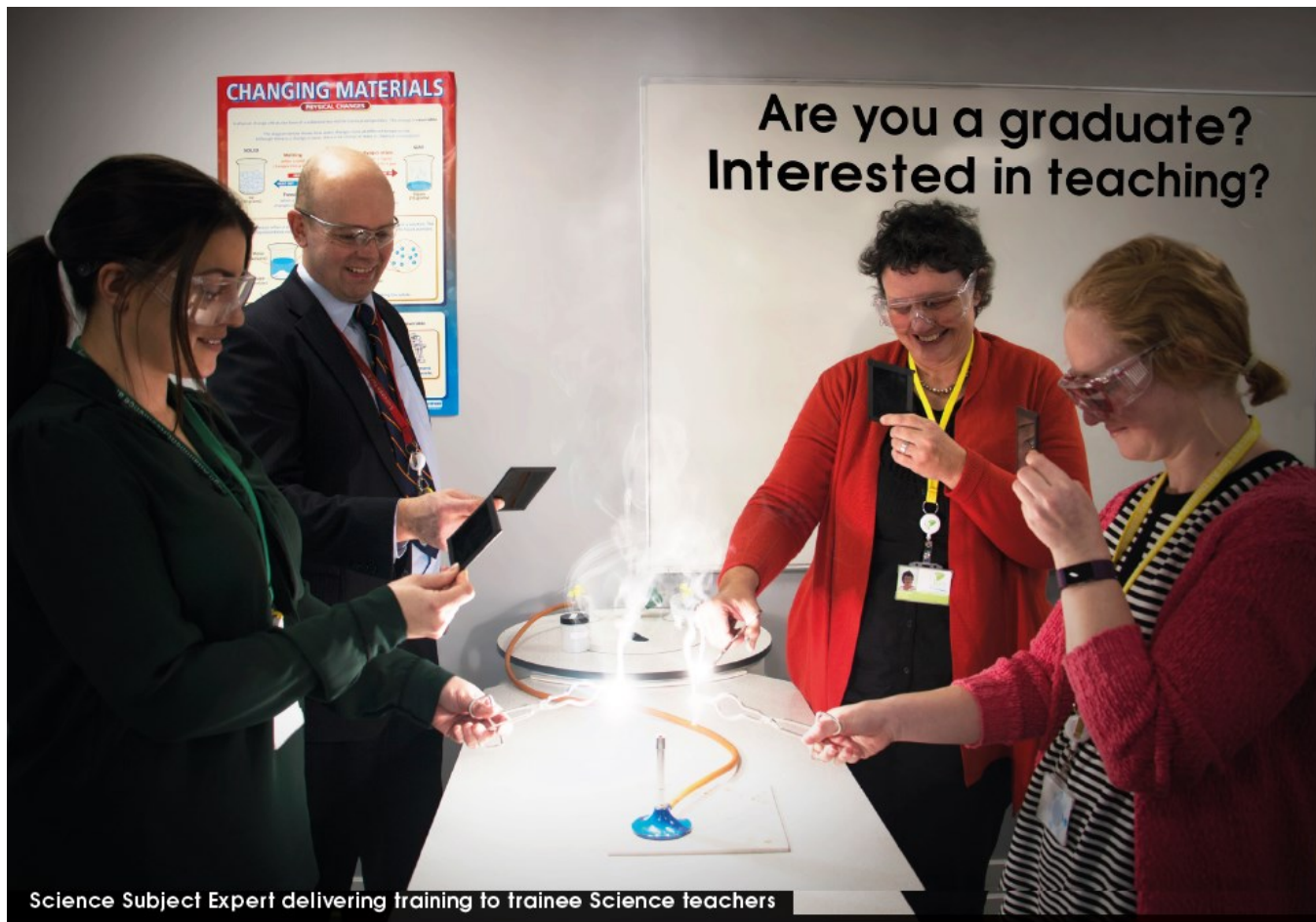
Science Subject Expert delivering training to trainee Science teachers