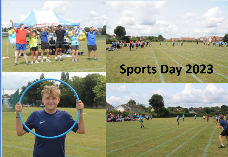
Sports Day 2023

What a week it has been with lots of events taking place across the school! Year 10 took part in a college taster day at HSDC, Year 5 Masterclasses and Open Afternoon with our brilliant Year 7 and 8 tour guides, Class of 2023 Prom and an amazing Sports Day. A huge well done and thank you to everyone who took part in these events!