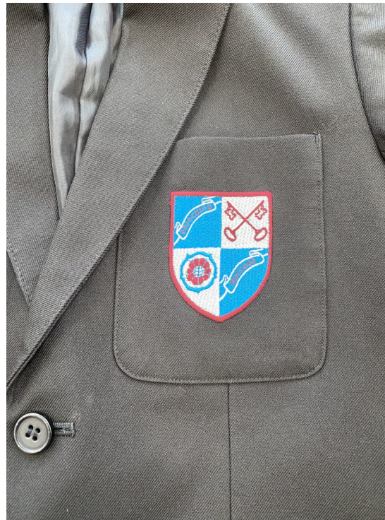
Girls & Boys Blazer